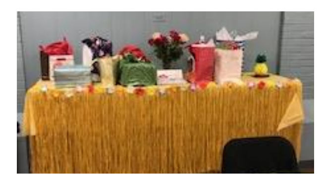
The Red Hats group party was held at Epiphany on June 20. The Red Hats meet the third Tuesday of the month at 11:00 a.m. at the Hi-View Restaurant on St. Charles Road. New members are always welcome!